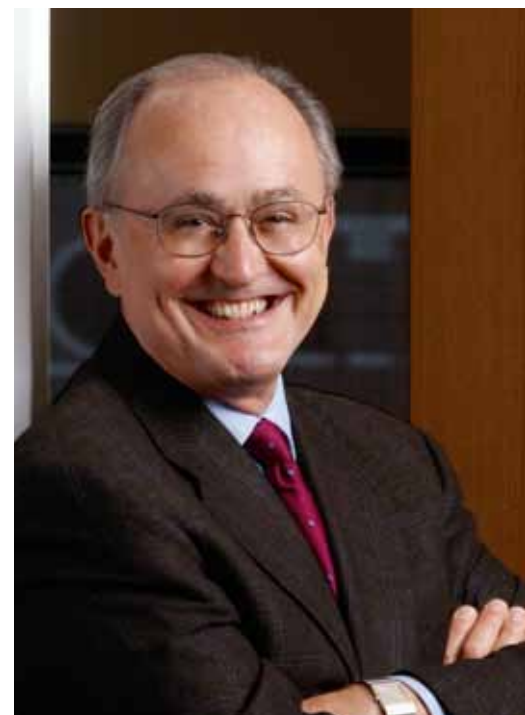
Professor John Ruggie

Many investors have applauded the establishment of these Principles, not least because they may improve the operational environment at many companies, benefiting their long-term financial growth. This said, Professor John Ruggie, who has led the work resulting in the publication of these Principles, notes that we can't just roll our sleeves down again and say "Job done!" Rather, he feels we now have a solid platform on which we can base continued efforts in the field of human rights.