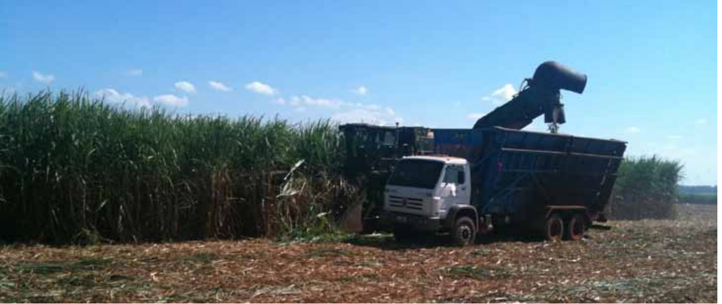
Harvesting sugar cane in Brazil