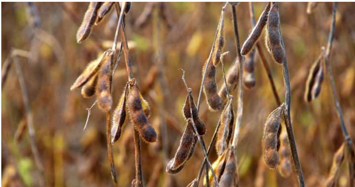
Soya beans in Brazil