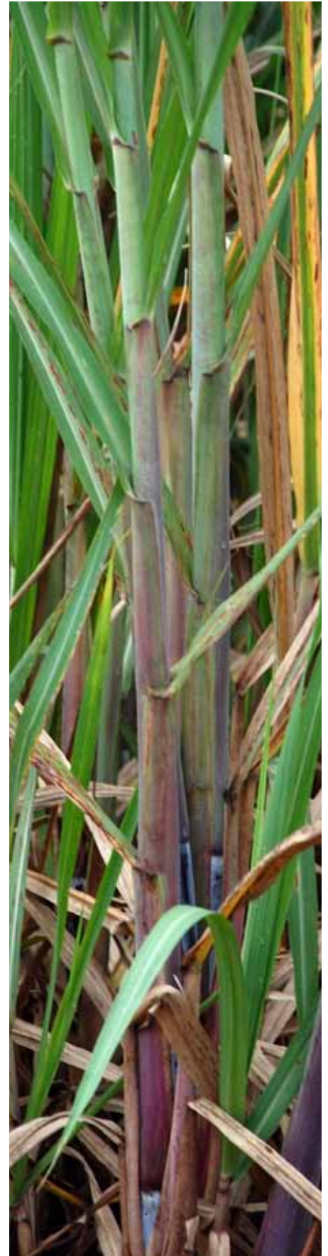
Sugar cane in Brasil

Over the past year, the Second AP Fund has chaired the PRI's farmland working group. The group is engaged in facilitating the integration of ESG factors in agricultural investment. During the year, the group has focused on a case study report. This will be published on the PRI website at www.unpri.org